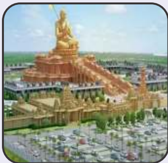
STATUE OF EQUALITY